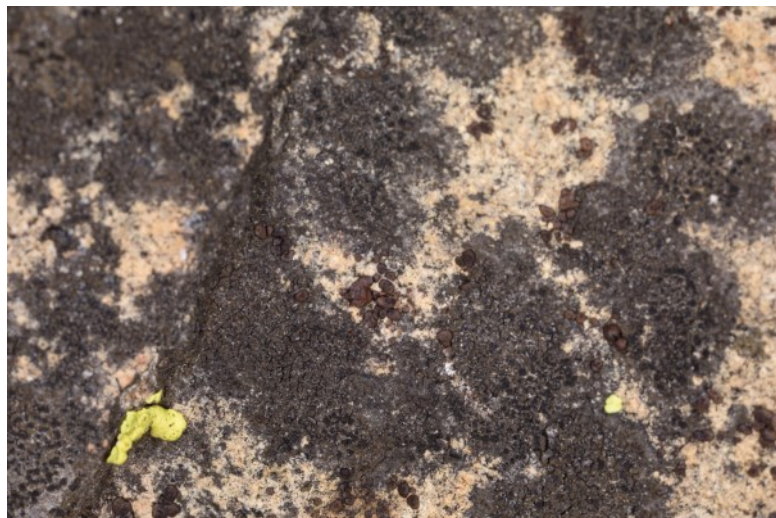
Closeup of individual rosettes.