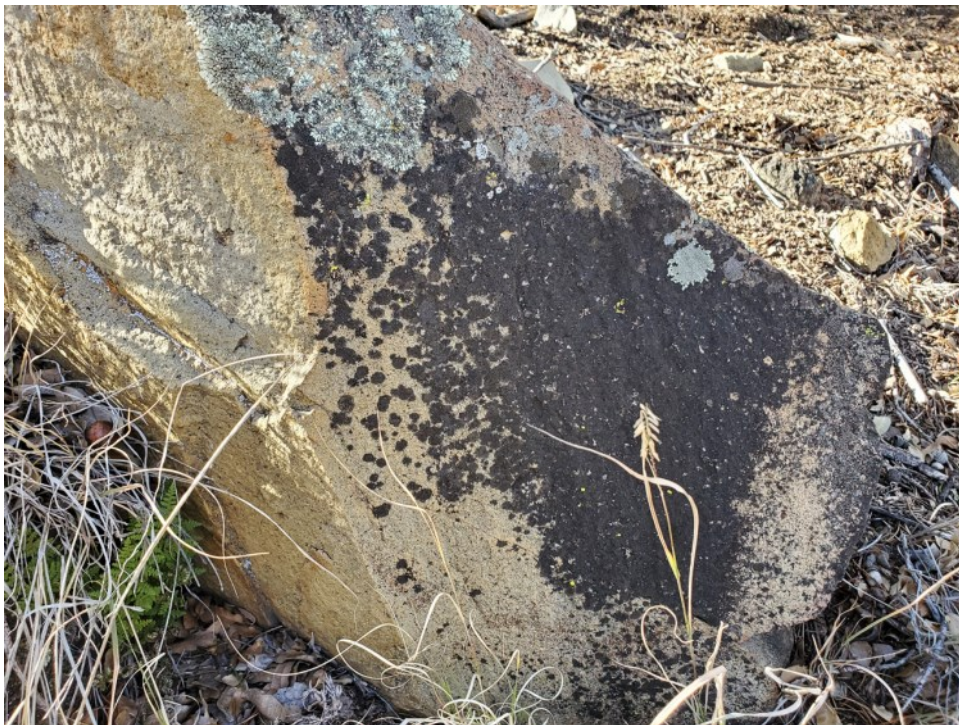
Rinodina confragosa (appearing black on boulder), with Xanthoparmelia (green gray lichen above it).

Rhinodina confragosa (Ach.) Körb.: New Mexico: Grant County: southern foothills of the Pinos Altos Mountains, piñon-juniper woodland, on granitic boulder, 6670 ft; UTM: NAD83 2S 0760313 3636860; 10 Dec 2019; Russ Kleinman 2019-12-10-1 & Karen Blisard (SNM).