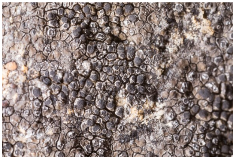
Macro-photo of thalli with apothecia